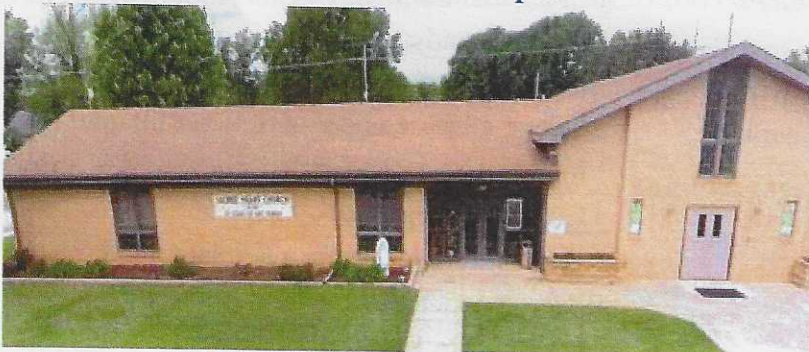
Sacred Heart in Anthony