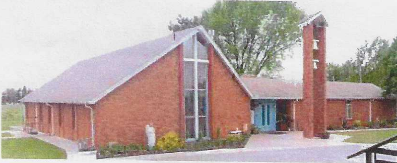
St. Patrick in Harper

30 minutes before weekend Masses, during Adoration or by appointment