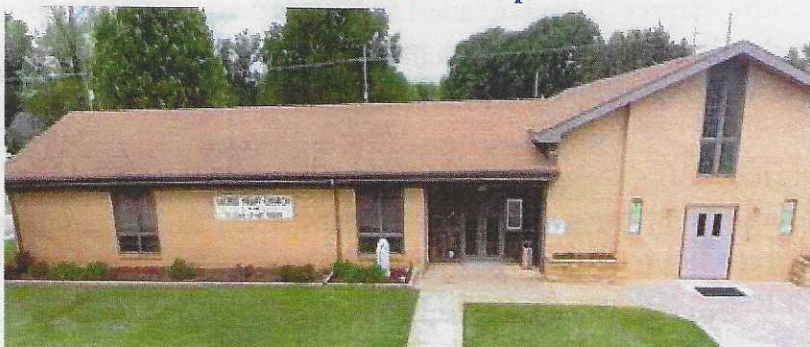
Sacred Heart in Anthony