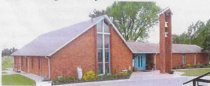
St. Patrick in Harper

30 minutes before Weekend Masses, during Adoration or by Appointment