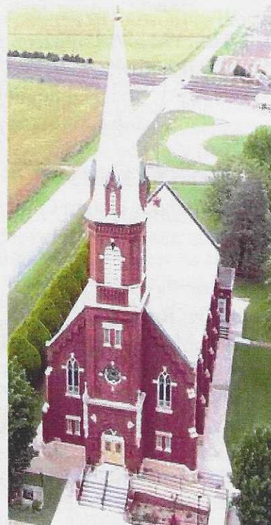
Immaculate Conception Church Danville

1023 W Main PO Box 218 – HARPER, KS – 67058 620-896-7886