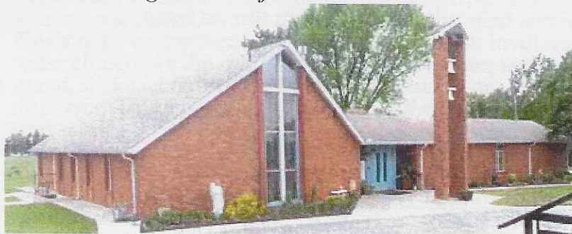
St. Patrick in Harper

30 minutes before Weekend Masses, during Adoration or by Appointment