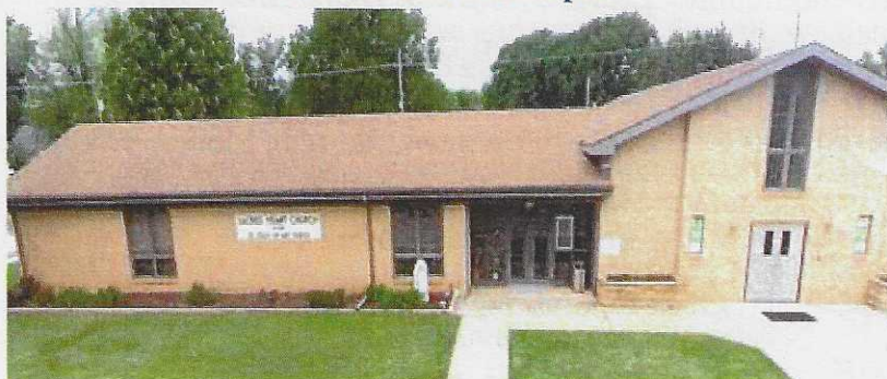
Sacred Heart in Anthony