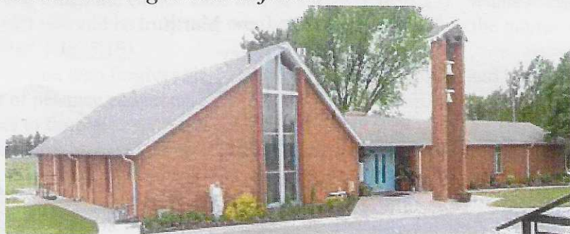
St. Patrick in Harper

30 minutes before Weekend Masses, during Adoration or by Appointment