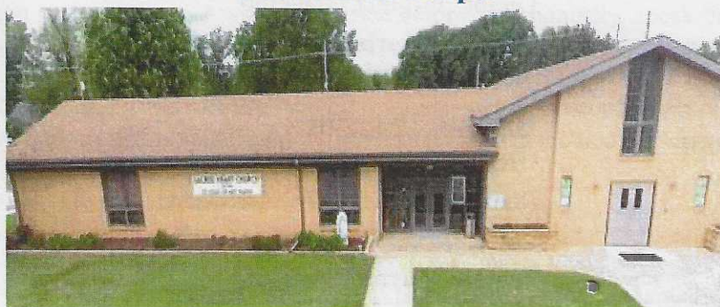
Sacred Heart in Anthony