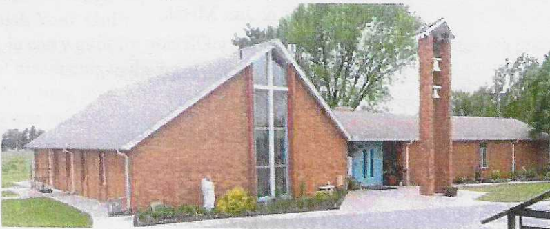
St. Patrick in Harper

30 minutes before Weekend Masses, during Adoration or by Appointment