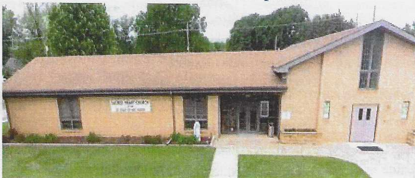
Sacred Heart in Anthony