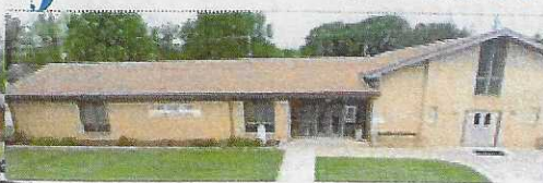
Sacred Heart, Anthony