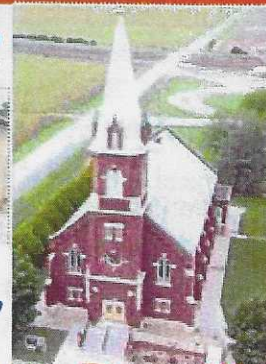
Immaculate Conception, Danville