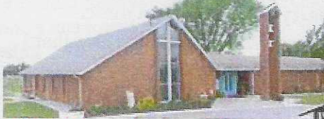
St. Patrick, Harper