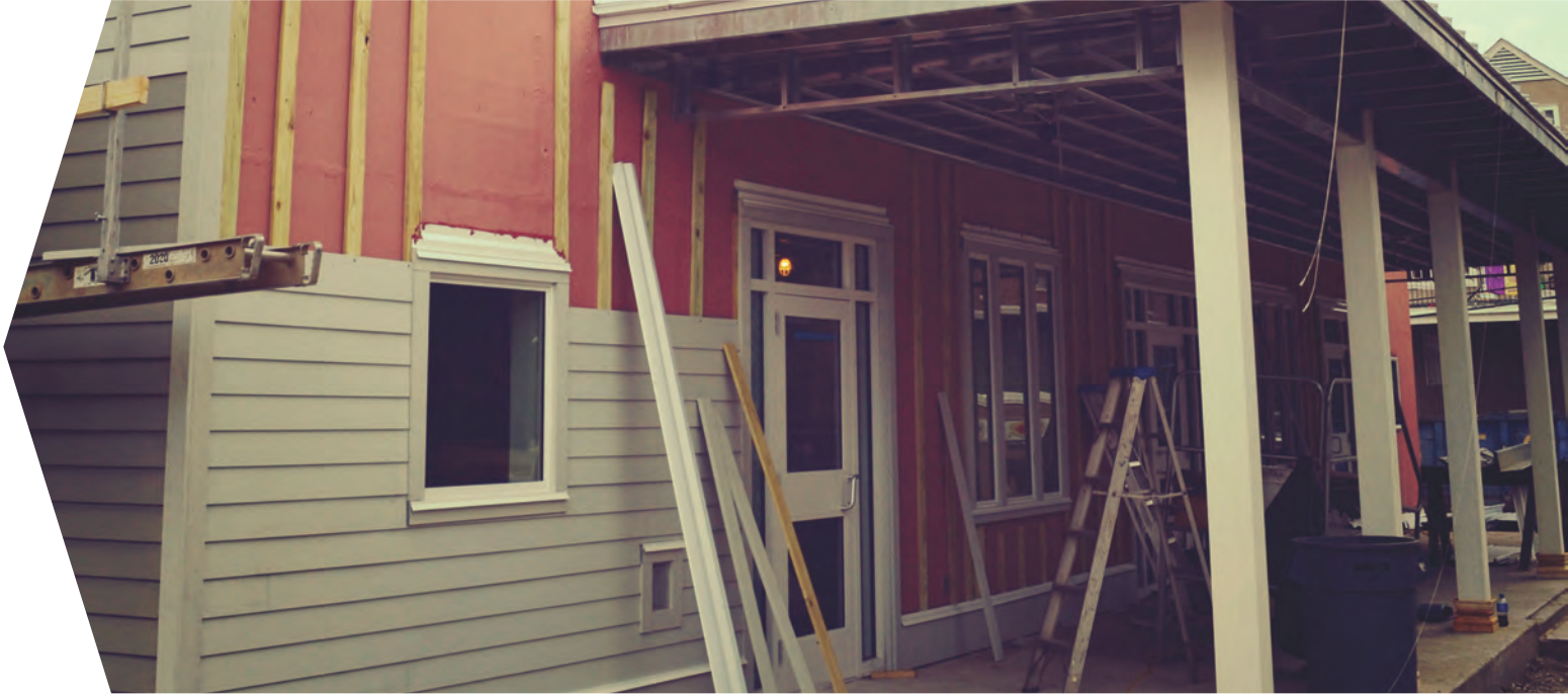
Entrance to new center—almost done! (May 11, 2015)