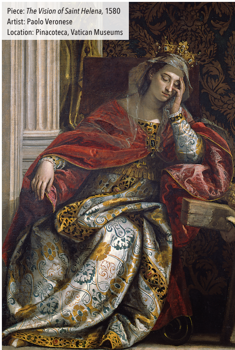
Piece: The Vision of Saint Helena , 1580 Artist: Paolo Veronese Location: Pinacoteca, Vatican Museums