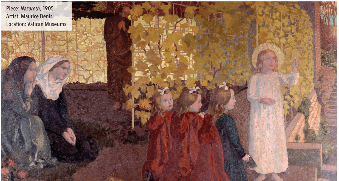
Piece: Nazareth , 1905 Artist: Maurice Denis Location: Vatican Museums

Is he not the carpenter, the son of Mary?...He was amazed at their lack of faith.