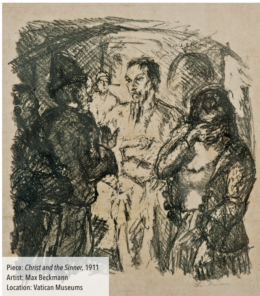
Piece: Christ and the Sinner , 1911 Artist: Max Beckmann Location: Vatican Museums