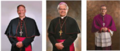
Our 2025 Nevada Seminarians

The drawing will be held on May 3, 2025!