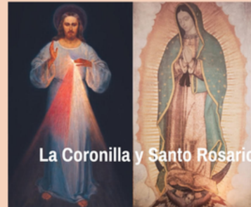
La Coronilla y Santo Rosario