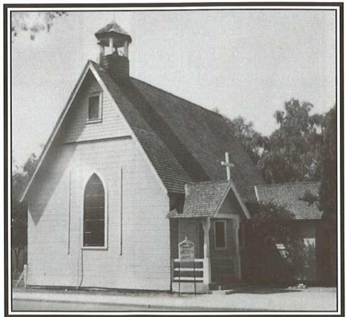
Original St. Rose of Lima Church at Pacific and Third