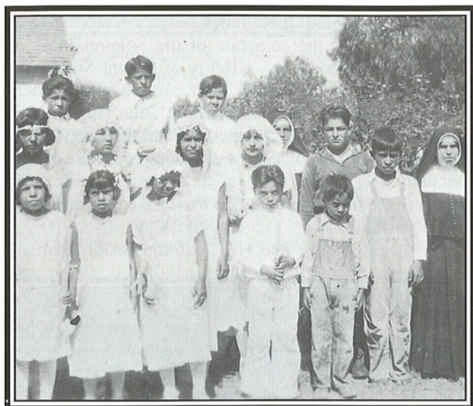
First Communion Class of 1929

time sixty-three children received their First Communion, nine marriages were performed, 144 children were enrolled in catechism and six converts were under instruction.