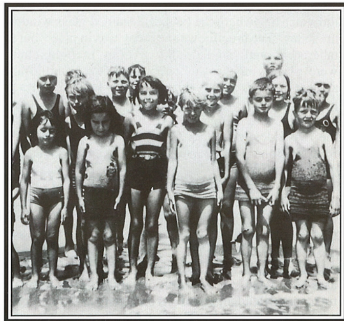
Parish children of the 1930's on an outing to Oxnard's "Hollywood by the Sea."