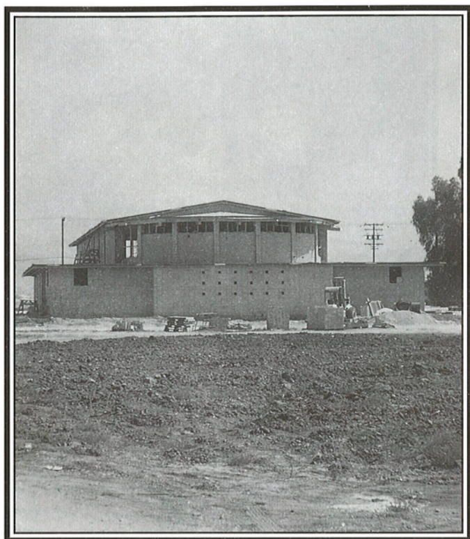
The new St. Rose of Lima Church in 1964

confirmed by Bishop John Ward on March 5, 1965 with 265 students. The new tabernacle, candelabra, and altar rail gates were in place and the church was only awaiting the arrival of the new windows to complete the sanctuary.