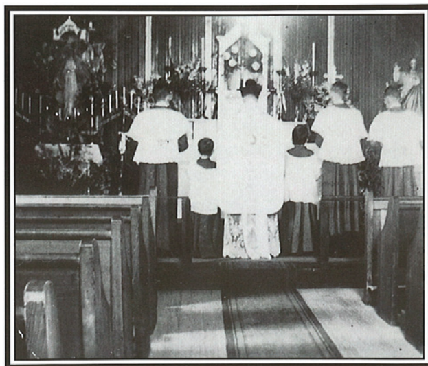
Celebrating Mass at St. Rose of Lima in the 1930's

The parish continued to grow, and in 1940 an addition to the church increased seating capacity to 160. The 1940 Census lists 152 registered families. At this