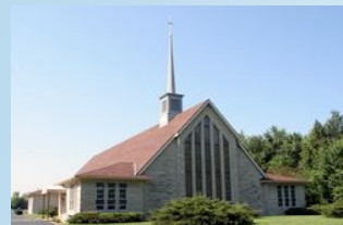
ST. MARY Catholic Church

Congratulations on the newest member of your family! Parents wishing to have their child baptized are asked to contact the Parish Office to make an appointment for pre-baptismal instruction.