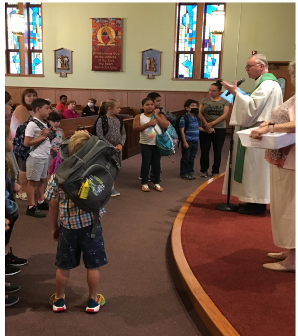
Blessing of the backpacks September 11, 2022

At the 9 a.m. Mass on Sunday, September 18, 2022, we will acknowledge the dedication of those who serve as catechists in our parish family. All catechists will be blessed and commissioned to be greater witnesses for Jesus.