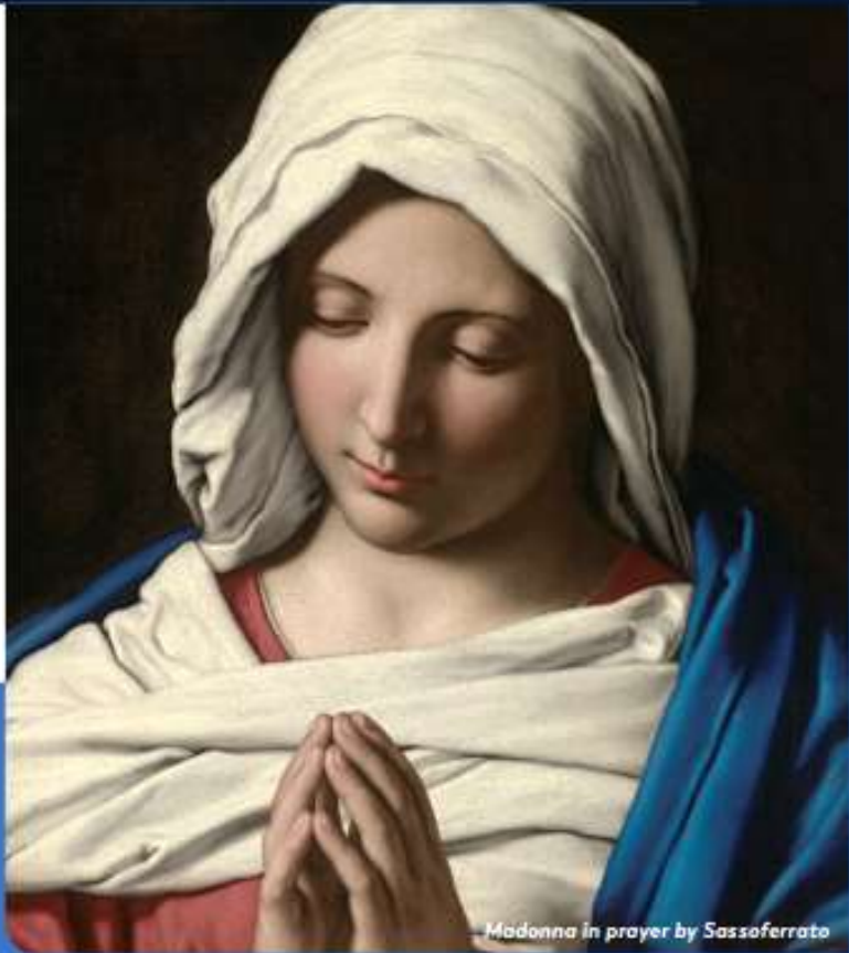
Madonna in prayer by Sassoferrato