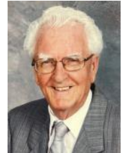
June 16, 1928 October 29, 2024