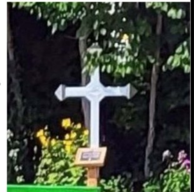
The photo above shows the cross in its former appealing garden setting. The cross dates back to 1891.

President of the Tecumseh Area Historical Society, Marilyn Pryor was very saddened to see that it had been stolen from its perch within the west garden area of the Museum Site. It was stolen sometime between Nov. 6th and 8th, 2025.