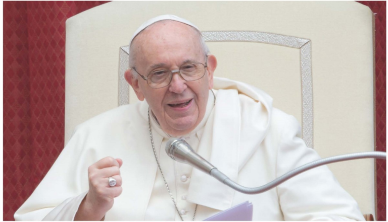
Pope Francis during the general audience at St. Damaso Courtyard at the Vatican on May 12, 2021.

“Parents, can you ‘waste time’ with your children? It is one of the most important things you can do each day.”