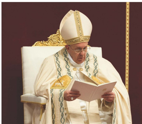
Pope Francis at St. Peter's Basilica during the Convocation of the Year of Mercy on April 11, 2015.

“The priest who seldom goes out of himself ... misses out on the best of our people, on what can stir the depths of his priestly heart. ... This is precisely the reason why some priests grow dissatisfied, lose heart and become in a sense collectors of antiquities or novelties — instead of being shepherds living with ‘the smell of the sheep.’ This is what I am asking you — be shepherds with the smell of sheep.”