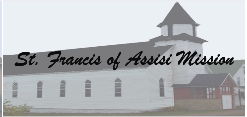
St. Francis of Assisi Mission