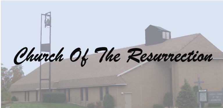
Church Of The Resurrection