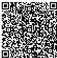
St. Jude the Apostle

Thank you for your faithful support and for being part of what God is doing in our parish communities—especially during this Easter season.