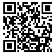
St. Michael the Archangel