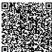
St. Jude the Apostle

Your generosity supports the mission of Saint Jude the Apostle and Saint Michael the Archangel, helping us to worship, serve others, and grow as disciples of Jesus Christ. For those who prefer to give electronically, QR codes for both parishes are available in the bulletin each week. Thank you for your faithful support and for being part of what God is doing in our parish communities.