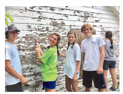
Senior High Youth Group members prepare a home for painting in Milwaukee.