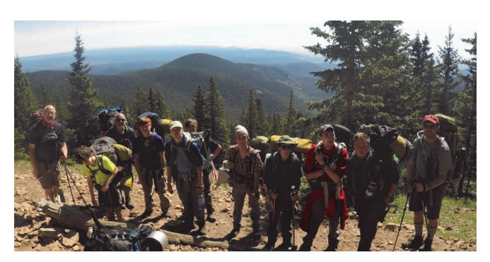
St. Louis Boy Scouts at the end of the trail. Congratulations!