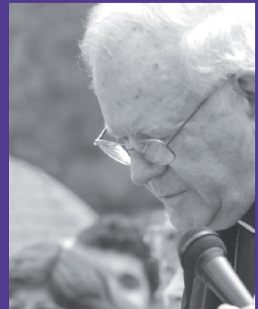
Bishop Moynihan praying for those involved with abortion.