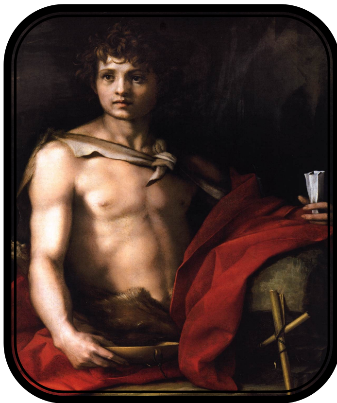
ST. JOHN THE BAPTIST (C. 1523) BY ANDREA DEL SARTO

SUNDAY, DECEMBER 7, 2014 • SECOND SUNDAY OF ADVENT • GOSPEL: MARK 1:1-8