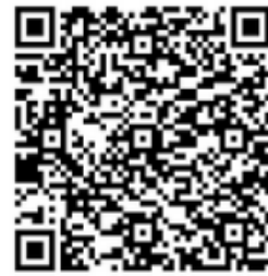
For Married Adults