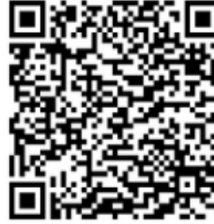
For Single Adults