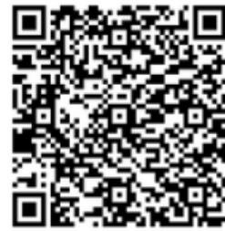
For Married Adults