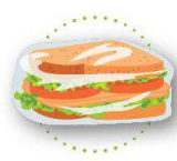
Ziploc & other reclosable food storage bags