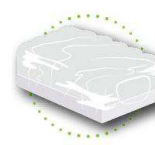
Wood pellet bags