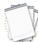
Plastic shipping envelopes