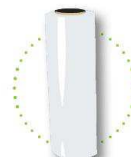
Pallet wrap & stretch film