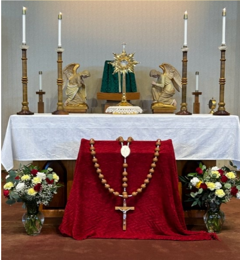
Month of the Rosary in Sacred Heart church