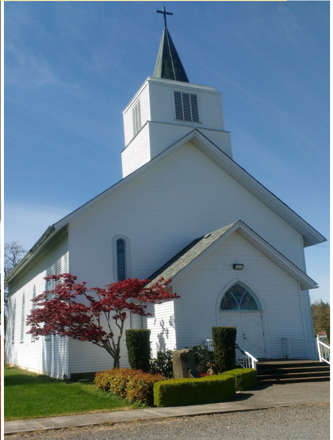
St. Louis church