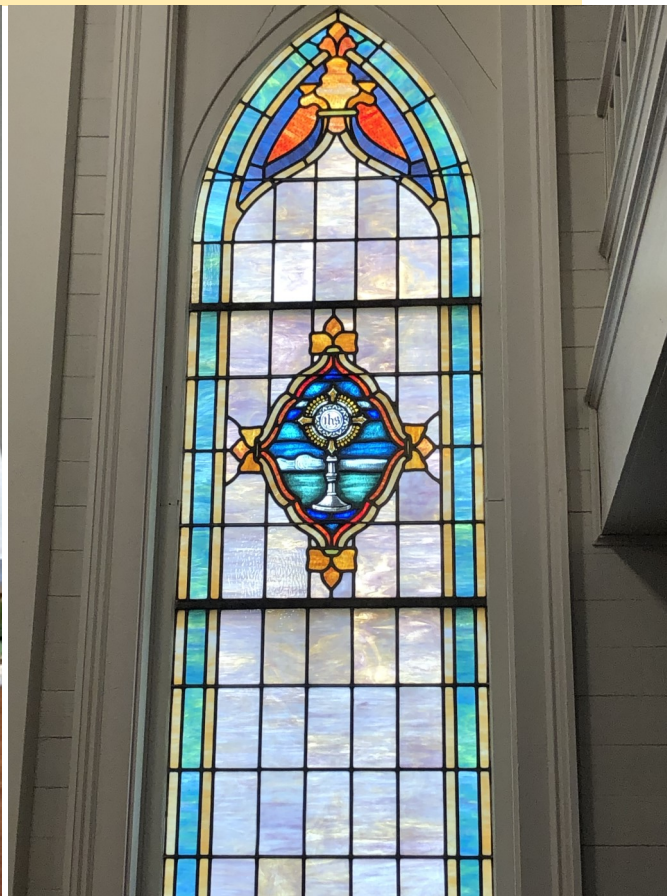
St. Louis church