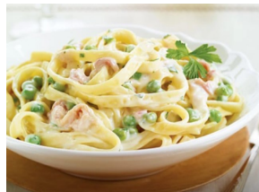
Fettuccine with Prosciutto and Peas