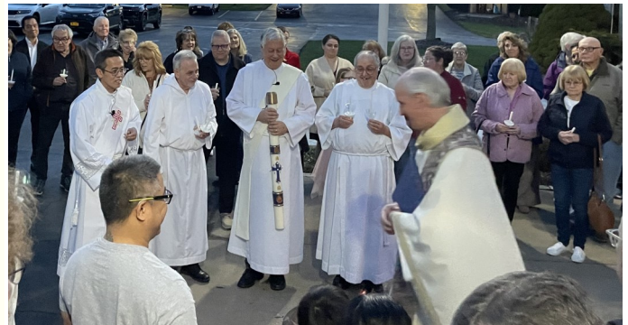
“A lovely night for the beginning of the Easter Vigil at our Easter fire, April 4 th , 8 p.m.”

He also encouraged the faithful to strengthen their faith during Holy Week and to ask the Lord that the paschal mystery renew in them the grace to be joyful witnesses of the Risen One, confident that love and peace are stronger than death.