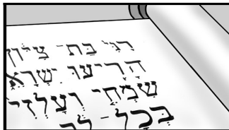
The first words of the reading, in Hebrew

Zephaniah wrote when a young king, Josiah, was on the throne. The two kings before Josiah had been Manasseh and Amon. During their reigns, the religious life of Israel had fallen to a low state.