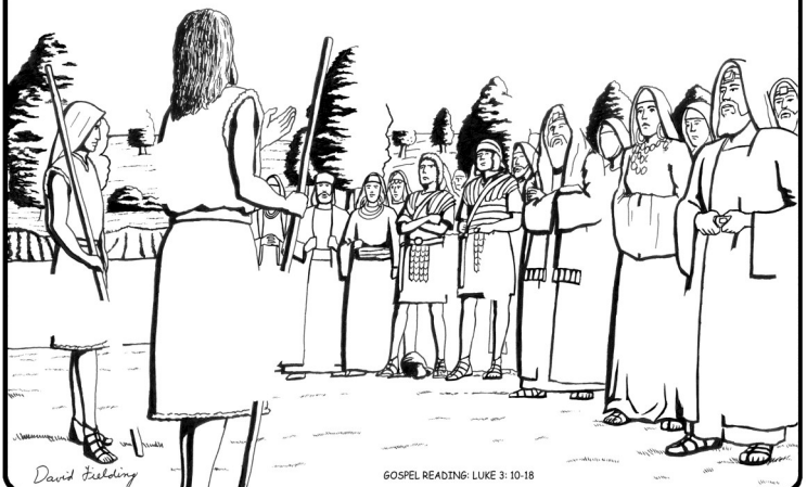
GOSPEL READING: LUKE 3: 10-18