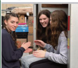
Well done everyone!

Thank you to all the teens and adults who helped us deliver the clothes, textiles, books, media and bottles and cans from our YIA Recycle Event!