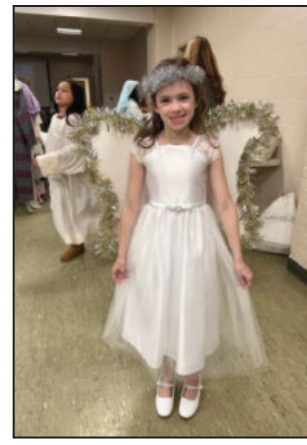
Getting ready for show time! Christmas Pageant 2023