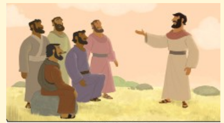
Jesus Taught The Beatitudes

Simple Terms: Happy are the people who work to make peace and good for others, for they will be called children of God.