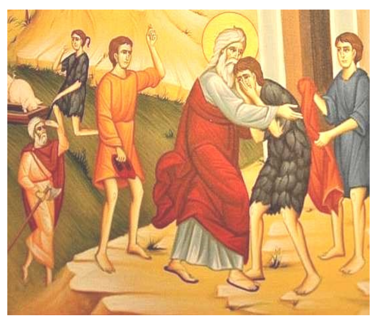
The Prodigal Son Returns

The Fourth Sunday In Lent March 30, 2025