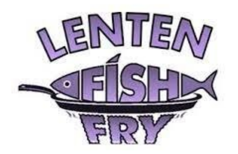
Fridays during Lent

LOVE GOD, LOVE ONE ANOTHER, GROW DISCIPLES