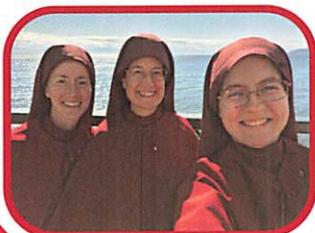
Photo: Sisters' retreat at Lake Baikal in September

Many missionaries are needed! Please join us in praying for vocations to serve the Roman Catholic Church in the Russian Far East. See our website for more information: www.cjd.cc .