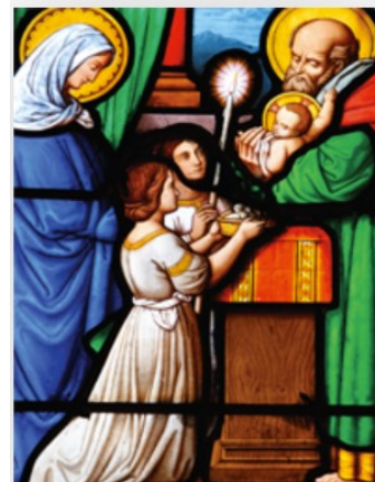
The Presentation at the Temple WORLD DAY FOR CONSECRATED LIFE

In 1997, Pope Saint John Paul II instituted a day of prayer for women and men in consecrated life. This celebration is attached to the Feast of the Presentation of the Lord on February 2 nd . This Feast is also known as Candlemas Day; the day on which candles are blessed symbolizing Christ who is the light of the world. So too, those in consecrated life are called to reflect the light of Jesus Christ to all peoples.—USCCB