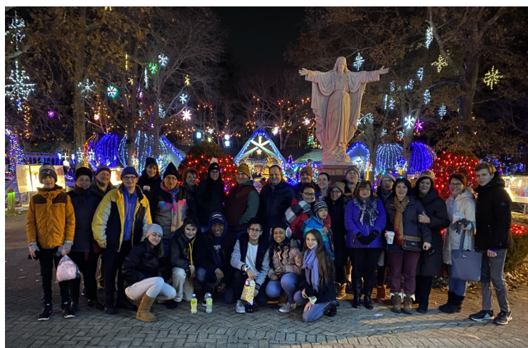
Parish trip to The National Shrine of Our Lady of La Sallette in Attleboro before Christmas.