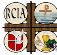
Rite of Christian Initiation for Adults

The RCIA (Rite of Christian Initiation for Adults) program at Our Lady of Mt. Carmel Parish and Our Lady of Loreto Parish begins in the fall and continues through the Easter season. This program is open to any ADULT who; 1) is interested in becoming Catholic, 2) is in need of receiving any one or all of the Sacraments of Initiation (Baptism, Confirmation and 1 st Communion, 3) wishes to enter into full communion with the Roman Catholic Church, as well as those who have been away from the Church and want to return and/or just want to learn more about the teachings of the Church.