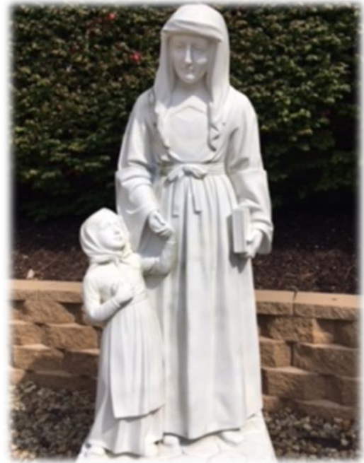
St. Louise de Marillac, Pray for Us!