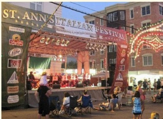
Picture from St. Ann's festival in Hoboken

Besides being a day to celebrate grandparents and elders, the feast of St. Anne is celebrated with festivities across Europe. Immigrants from Italy brought those festivities to the U.S., including our neighboring city of Hoboken, where immigrants from San Giacomo preserved their religious and traditional values in their new home. These "San Giacomese Hobokenites" established the St. Ann's Society, and for 115 years now have celebrated the feast with a festival.