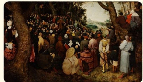
The Sermon of Saint John the Baptist Peter Breughel the Elder Located in Budapest

He went throughout [the] whole region of the Jordan, proclaiming a baptism of repentance for the forgiveness of sins, as it is written in the book of the words of the prophet Isaiah: