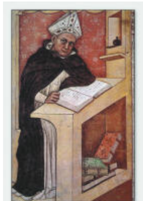
St. Albert the Great ca. 1193 - 1280 Memorial - 15 November Doctor of the Church

St. Albert was a Dominican priest and later consecrated a bishop. He was also a teacher of St. Thomas Aquinas and is remembered as one of the most brilliant minds in the history of the Church.