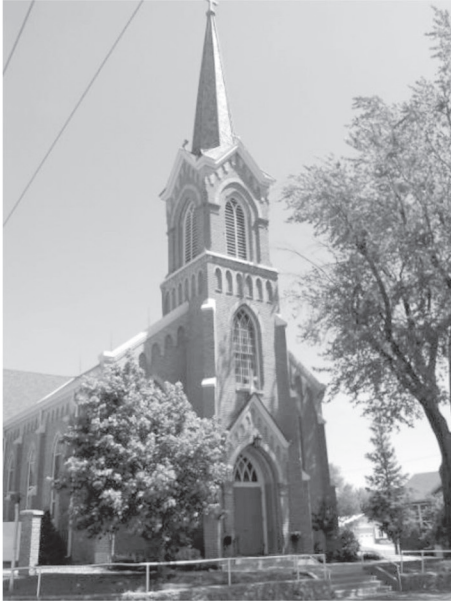
St. John the Evangelist