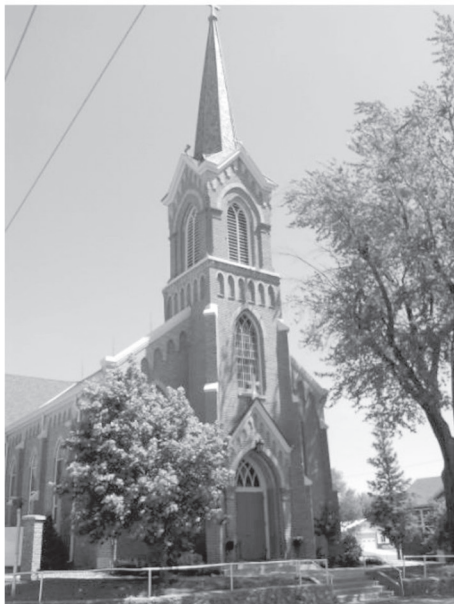
St. John the Evangelist

Parish Mission Statement We are a Catholic community forming disciples of Jesus Christ dedicated to loving God through our worship, sharing the Good News, and loving service to others.