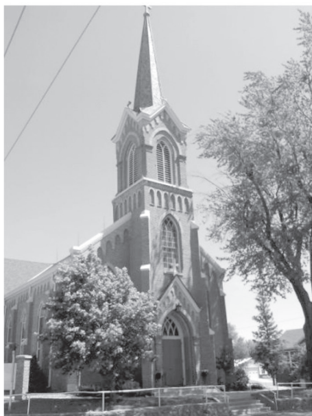
St. John the Evangelist

Parish Mission Statement We are a Catholic community forming disciples of Jesus Christ dedicated to loving God through our worship, sharing the Good News, and loving service to others.