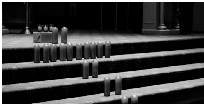
Candles representing 183 abortions in 2019 in Scott and Le Sueur Counties