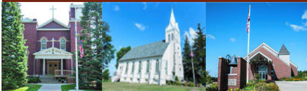
St. John, Coggon | St. Joseph, Prairieburg | St. Stephen, Central City